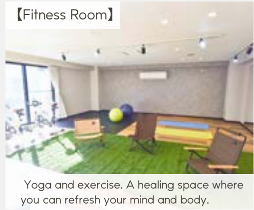
Yoga and exercise. A healing space where you can refresh your mind and body.