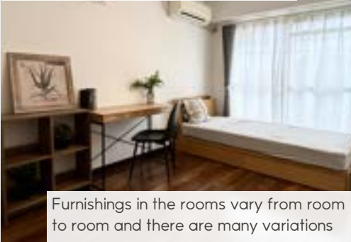
Furnishings in the rooms vary from room to room and there are many variations