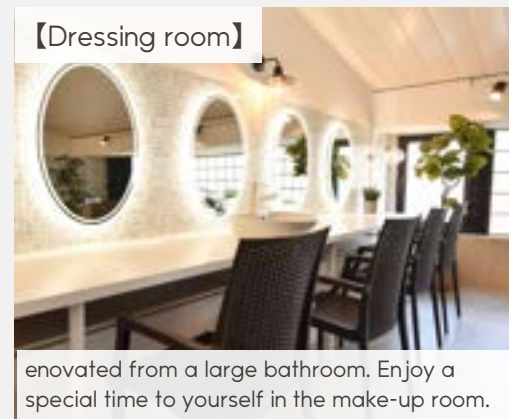
enovated from a large bathroom. Enjoy a special time to yourself in the make-up room.