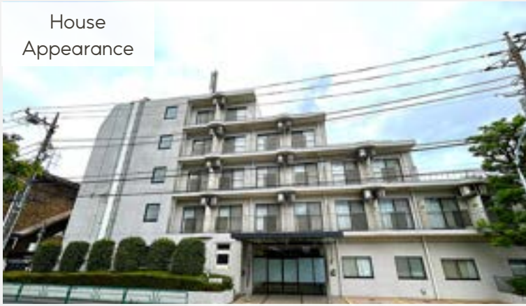
(79 rooms/ 5-story steel-framed reinforced concrete)