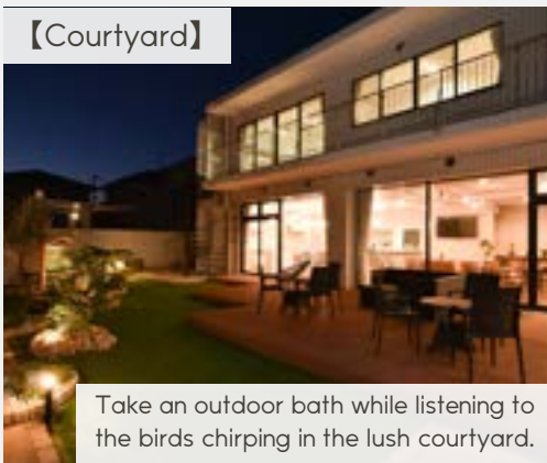
Take an outdoor bath while listening to the birds chirping in the lush courtyard.