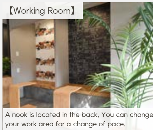
A nook is located in the back, You can change your work area for a change of pace.