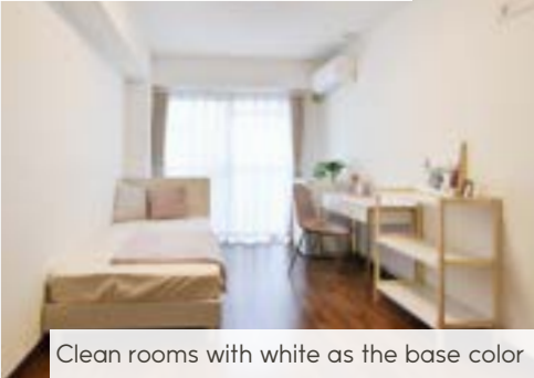
Clean rooms with white as the base color