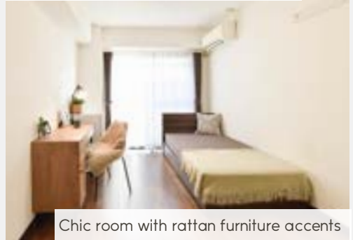
Chic room with rattan furniture accents

All rooms are furnished with furniture (desk, chair, bed), home appliances (air conditioner, refrigerator), balcony, and closet/ 12.5m 2