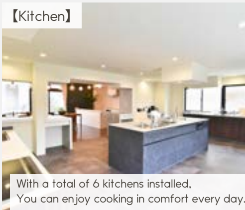
With a total of 6 kitchens installed, You can enjoy cooking in comfort every day.